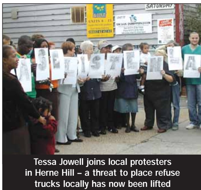
Tessa Jowell joins local protesters in Herne Hill – a threat to place refuse trucks locally has now been lifted

Local residents have also been pleased that plans to move refuse trucks away from the site of the new school will not now result in them being moved to Milkwood Road in Herne Hill.