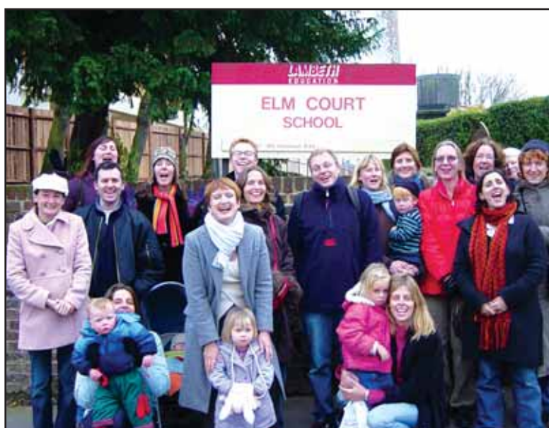
Flashback: Tessa Jowell with campaigners for a new Secondary School in West Norwood. Tessa presented a petition to Education Ministers who have now backed the new school

Tessa commented: "It is great news that this new parent-promoted school will open in West Norwood next year. It is a testament to the hard work of the truly remarkable group of parents who have led this project".